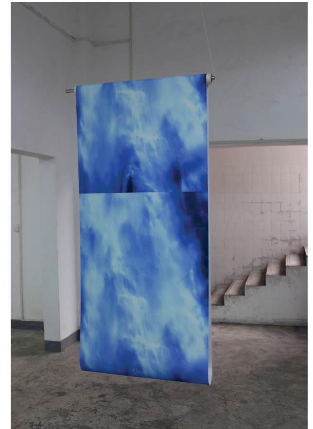
Tully Arnot Waterfall 2016 digital print on fabric, shutterstock image, metal, plastic, motor, electronics 350 x 120 x 15 cm