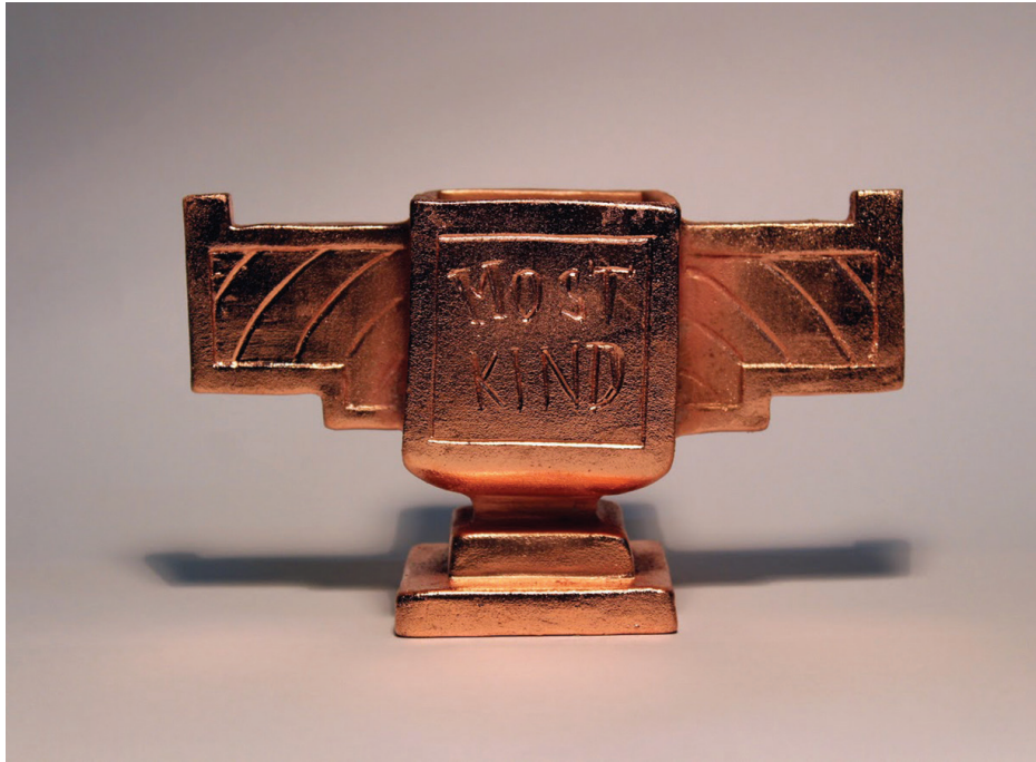
Abdul Abdullah Most kind 2016 ceramic 17 x 12 x 7 cm