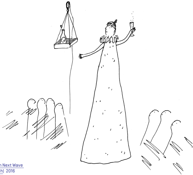
Beth Dillon The Tallest Artist in Next Wave [Preliminary Sketch] 2016 pen on paper 29.7 x 21 cm