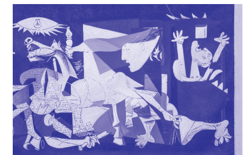
Artsheaven.com [detail] painting-8598 [Guernica][detail] 2016 oil painting reproduction on canvas, 61 x 122 cm

The intertextuality of Monster Maker exemplifies the widely applied technique of artistic appropriation which, having once suffered criticism as an indication of unoriginal creative thought, is now embraced by theorists and critics alike as a vital strategy in modern and contemporary art. However, to what extent can the disassociation of ideas of artistic value, originality and authorship be pushed? The Fraud Complex integrates a number of