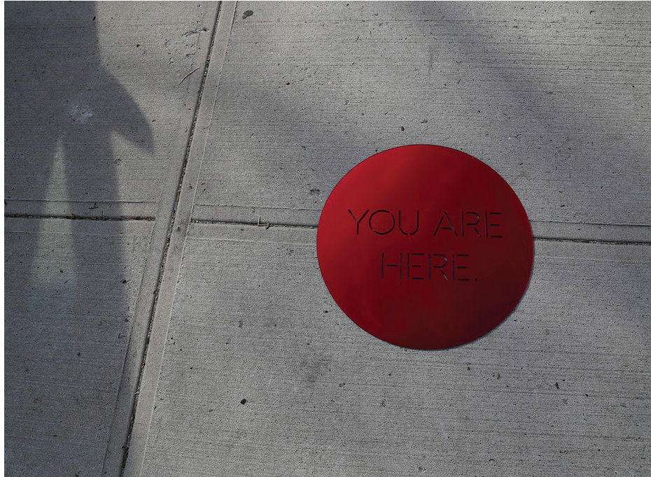
Sara Morawetz You Are Here. [From 1:1 [After Umberto]] 2016 mirrored perspex, mixed media installation perspex: 50.8 x 50.8 cm