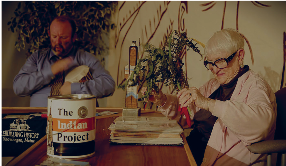
Yoshua Okón The Indian Project [still] 2015 single-channel video, colour, sound duration: 15:26 minutes