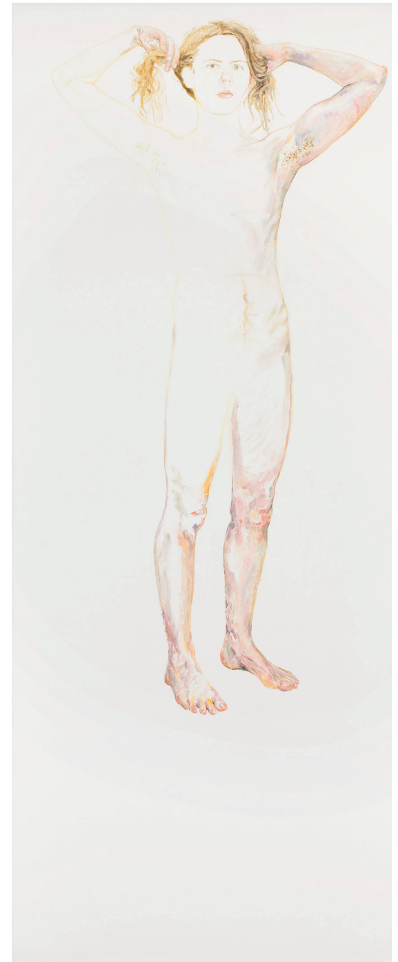
Tyza Stewart Self Portrait 2015 oil on board 185 x 70 cm Image courtesy of the artists and Heiser Gallery, Brisbane Photograph: Jon Linkins