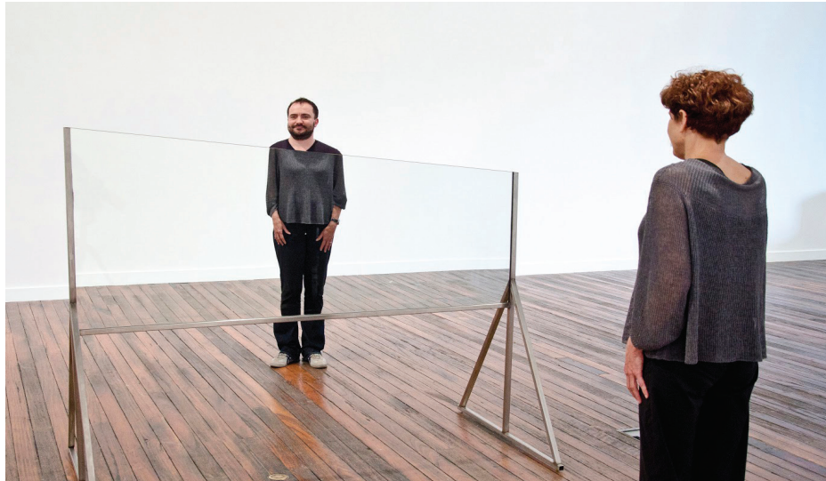
Hany Armanious Body Swap 2015 mirror, steel 150 x 200 x 55 cm

Image courtesy of the artist and Roslyn Oxley9 Gallery, Sydney Photograph: Peter Morgan