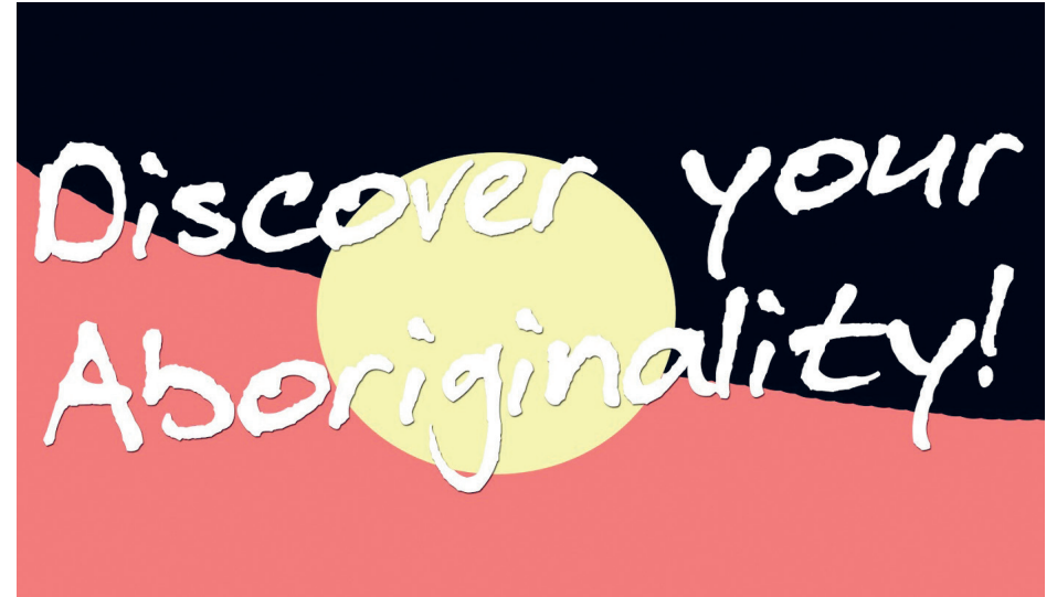
Megan Cope Discover your Aboriginality 2016 mixed media