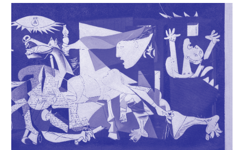
Artsheaven.com [detail] painting-8598 [Guernica][detail] 2016 oil painting reproduction on canvas, 61 x 122 cm

The intertextuality of Monster Maker exemplifies the widely applied technique of artistic appropriation which, having once suffered criticism as an indication of unoriginal creative thought, is now embraced by theorists and critics alike as a vital strategy in modern and contemporary art. However, to what extent can the disassociation of ideas of artistic value, originality and authorship be pushed? The Fraud Complex integrates a number of